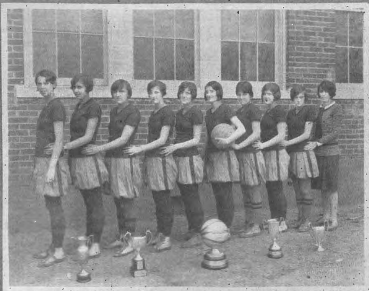
LINDEN MIDDLE TENNESSEE CHAMPIONS 1930