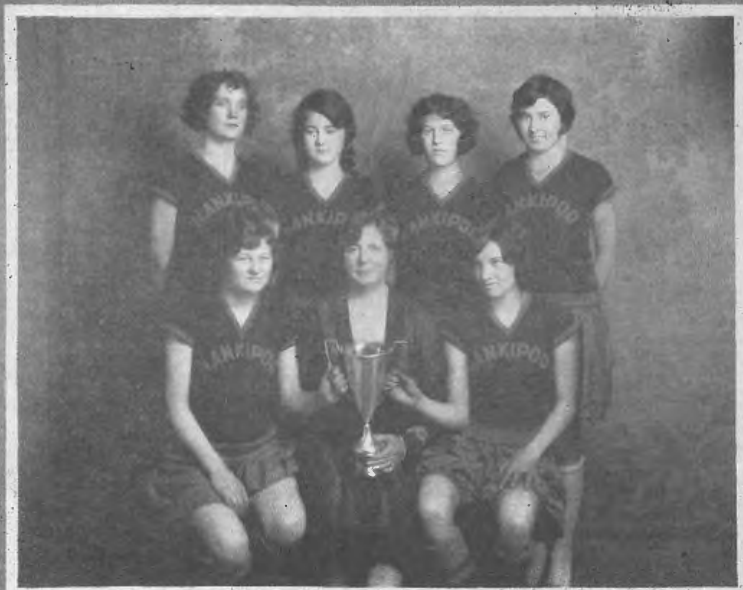
NANKIPOO WEST TENNESSEE CHAMPIONS 1930