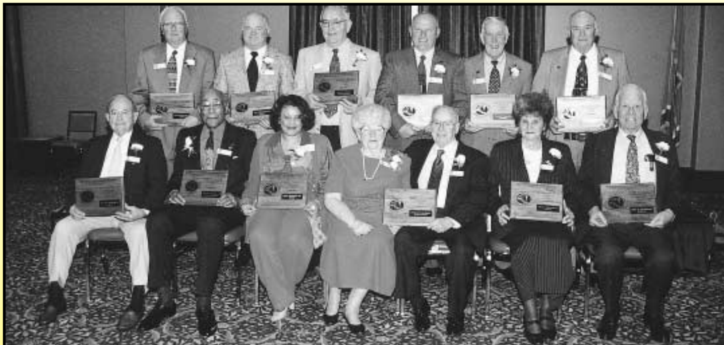
2001 TSSAA Hall of Fame Inductees